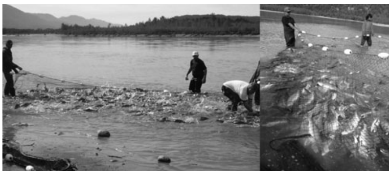
Fig. 2. The aboriginal beach seine being pulled into shore to crowd fish for sorting.